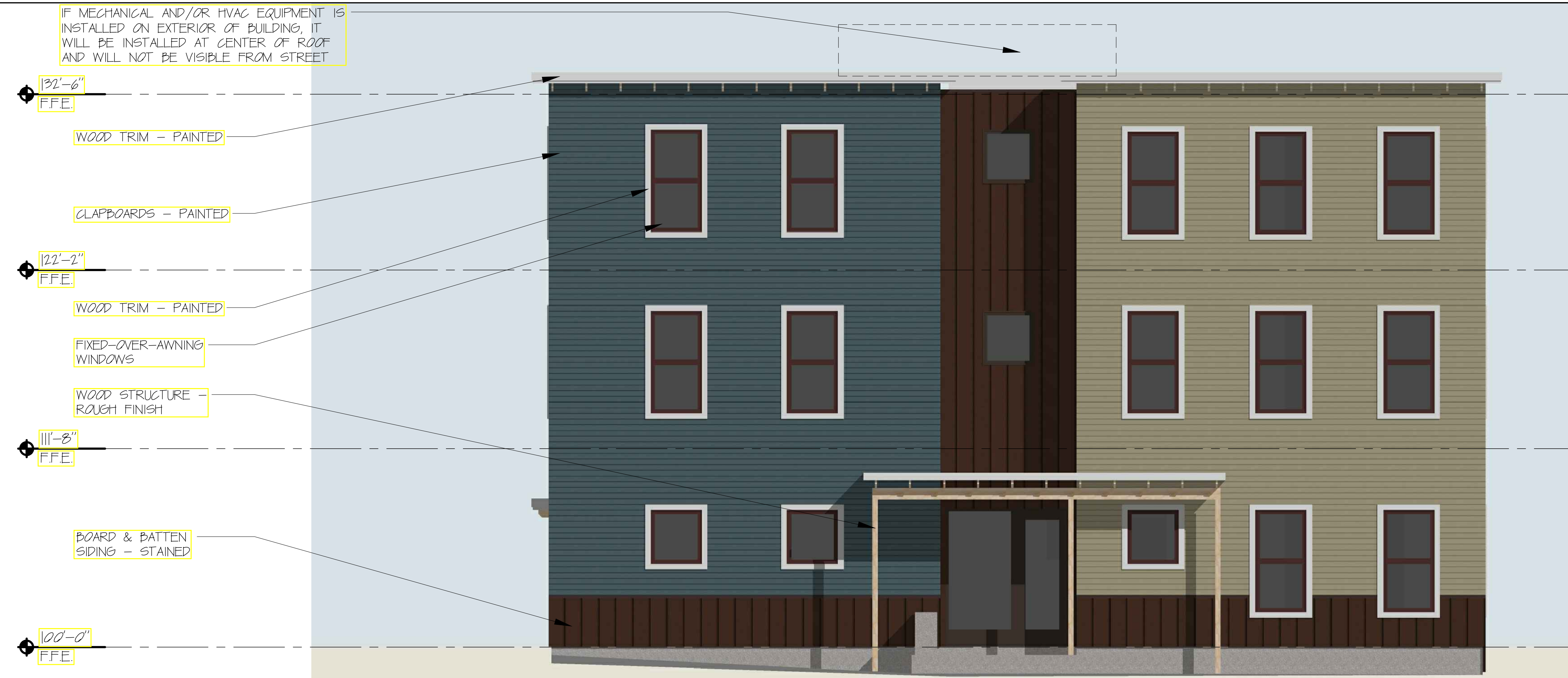
FRONT ELEVATION 0 4'-0" SCALE: 1/4" = 1'-0"