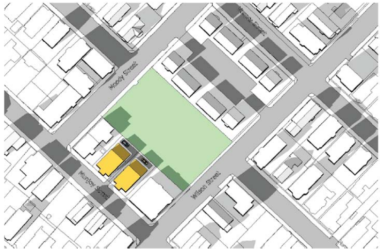
Figure 5: Preliminary shadow study by Bluestone Planning Group

Per the city’s Technical Manual , proposals for structures greater than 45 feet tall outside the B3, B5, B6, and B7 zones are required to include a preliminary shadow analysis to determine if adverse impacts to publicly accessible open spaces are likely. The proposed building stands less than 45 feet tall. However, in this case, since the site lies west of a city park, the city’s advance planning work by the Bluestone Planning Group considered the issue of shadow impacts. The study found that a three story structure including eight dwelling units and set back from the rear property line, with an additional