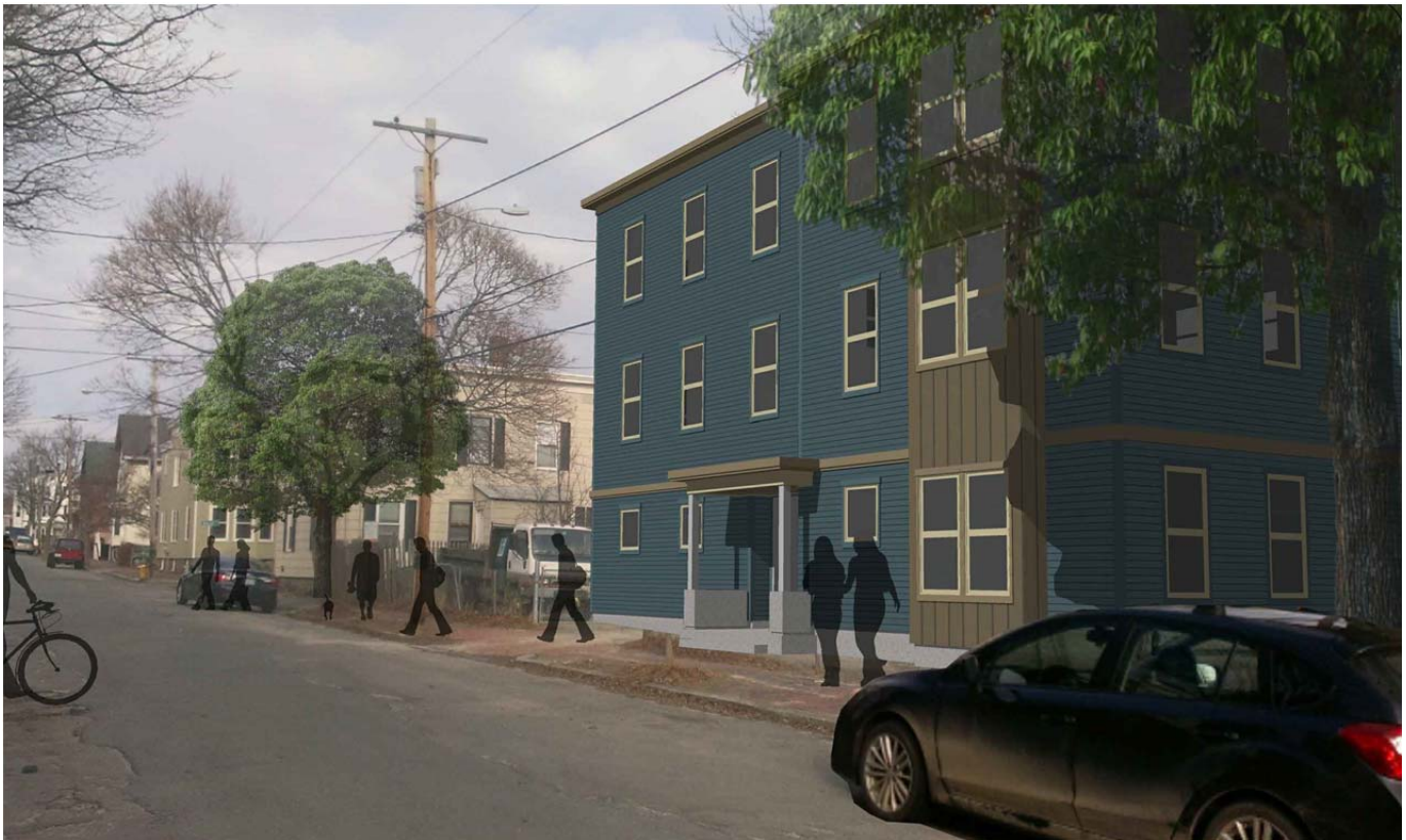
Figure 4: Proposed development at 65 Munjoy Street, looking north