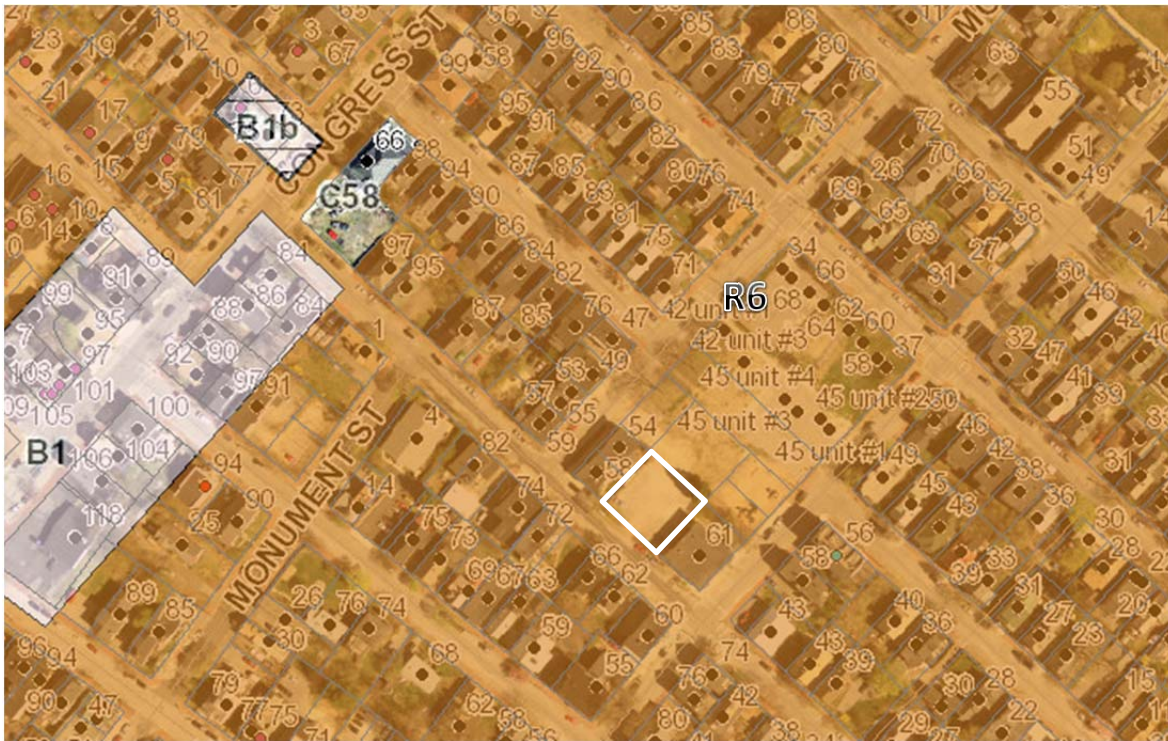
Figure 3: 65 Munjoy zoning context