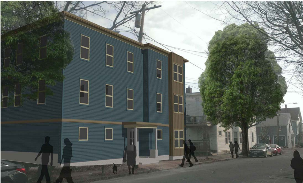
Figure 6: Proposed development at 65 Munjoy Street from the north

Adam’s Apple responded to the 65 Munjoy Street RFP with drawings which depicted one larger building, instead of two side-by-side triple deckers. In their proposal, they wrote, “[i]nitial plans to develop the site with two buildings...was [sic] abandoned due to the much higher costs of building redundant foundations, envelopes, circulation spaces, utility connections, metering systems, mechanical systems, and stair towers.” They also noted the high cost of environmental remediation ( Attachment BG-6 ).