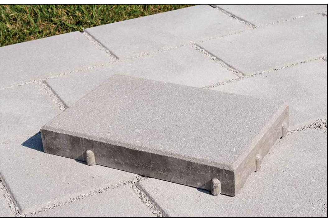
For Patio area, pavers to be hanover permeable 12" x 18" staggered as shown in plan. Final layout TBD