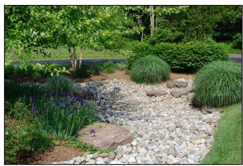
Example of riverstone raingarden