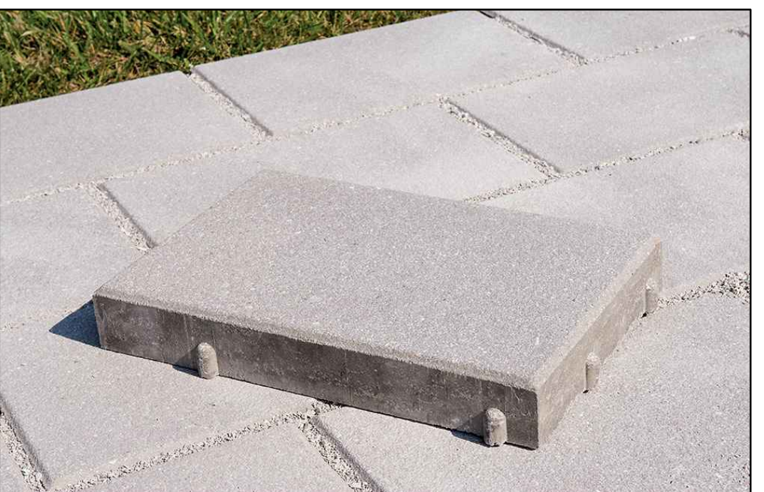
For Patio area, pavers to be hanover permeable 12" x 18" staggered as shown in plan. Final layout TBD