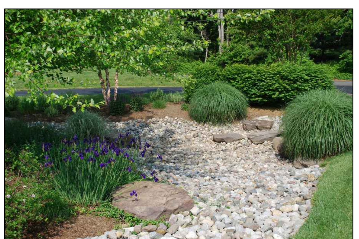
Example of riverstone raingarden