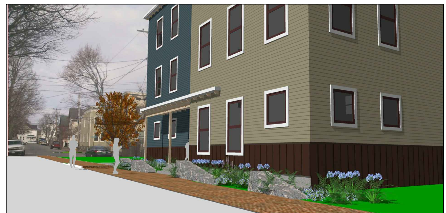
VIEWS FROM MUNJOY STREET