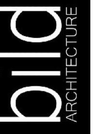
Bild Architecture PO Box 8235 Portland, ME 04104 207.408.0168 evan@bildarchitecture.com

PROJECT NO. 14036 PROJECT NAME 65 MUNJOY STREET ADAM'S APPLE LLC