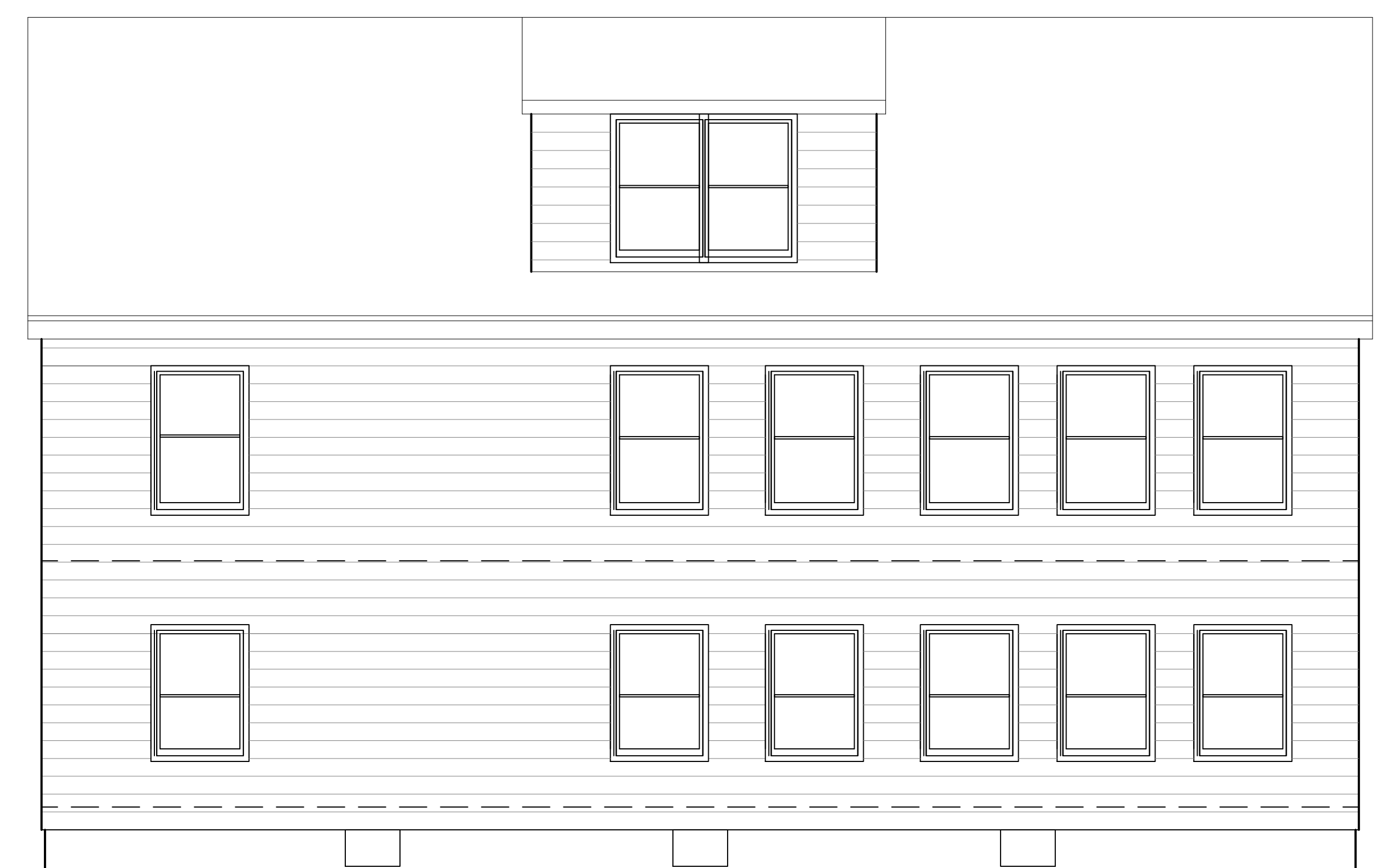
EXISTING RIGHT SIDE ELEVATION