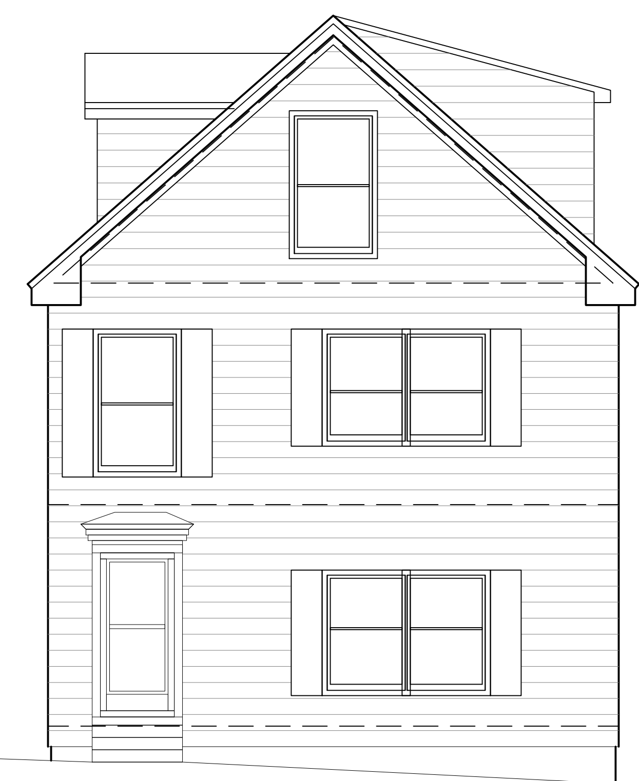
EXISTING STREET ELEVATION