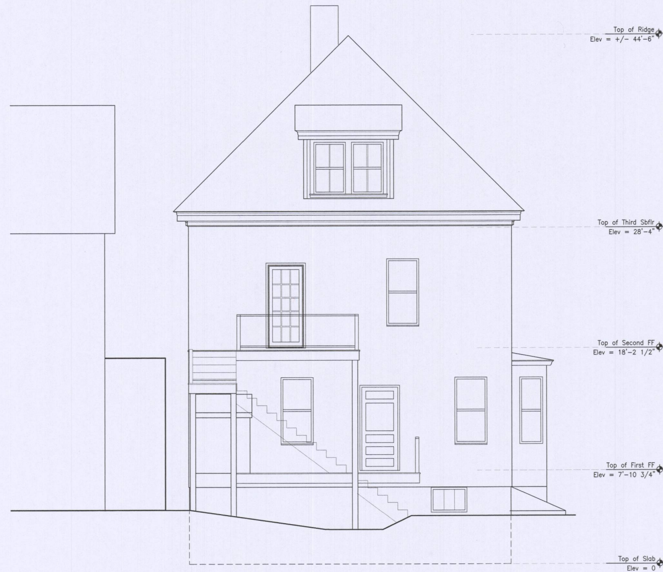
3a Existing South Elevation