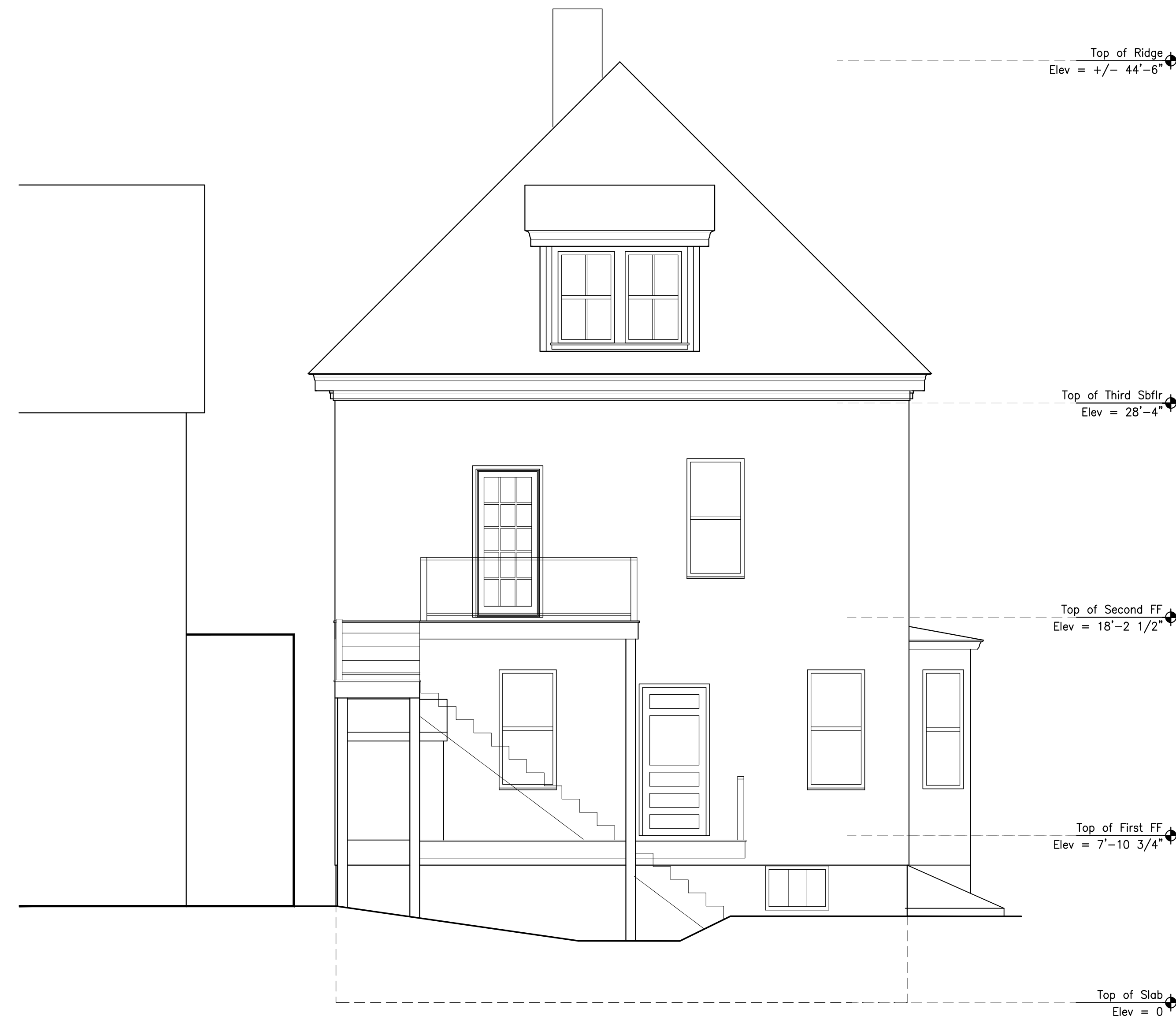
3a Existing South Elevation