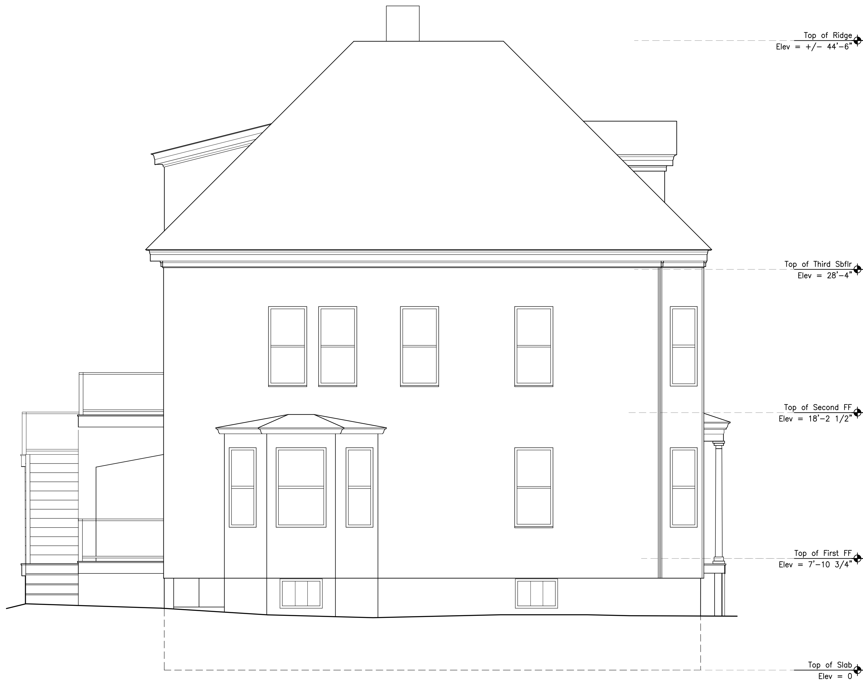
2a Existing East Elevation