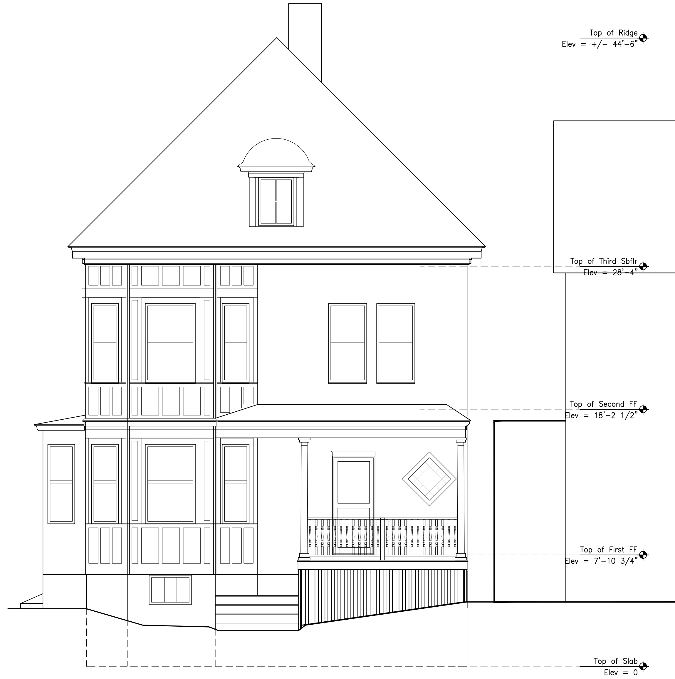
1a Existing North Elevation