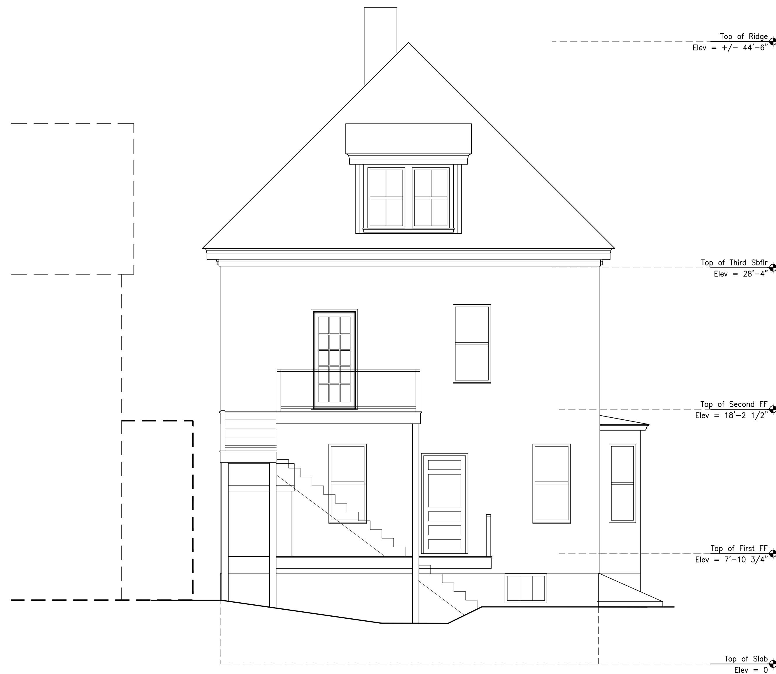
3a Existing South Elevation