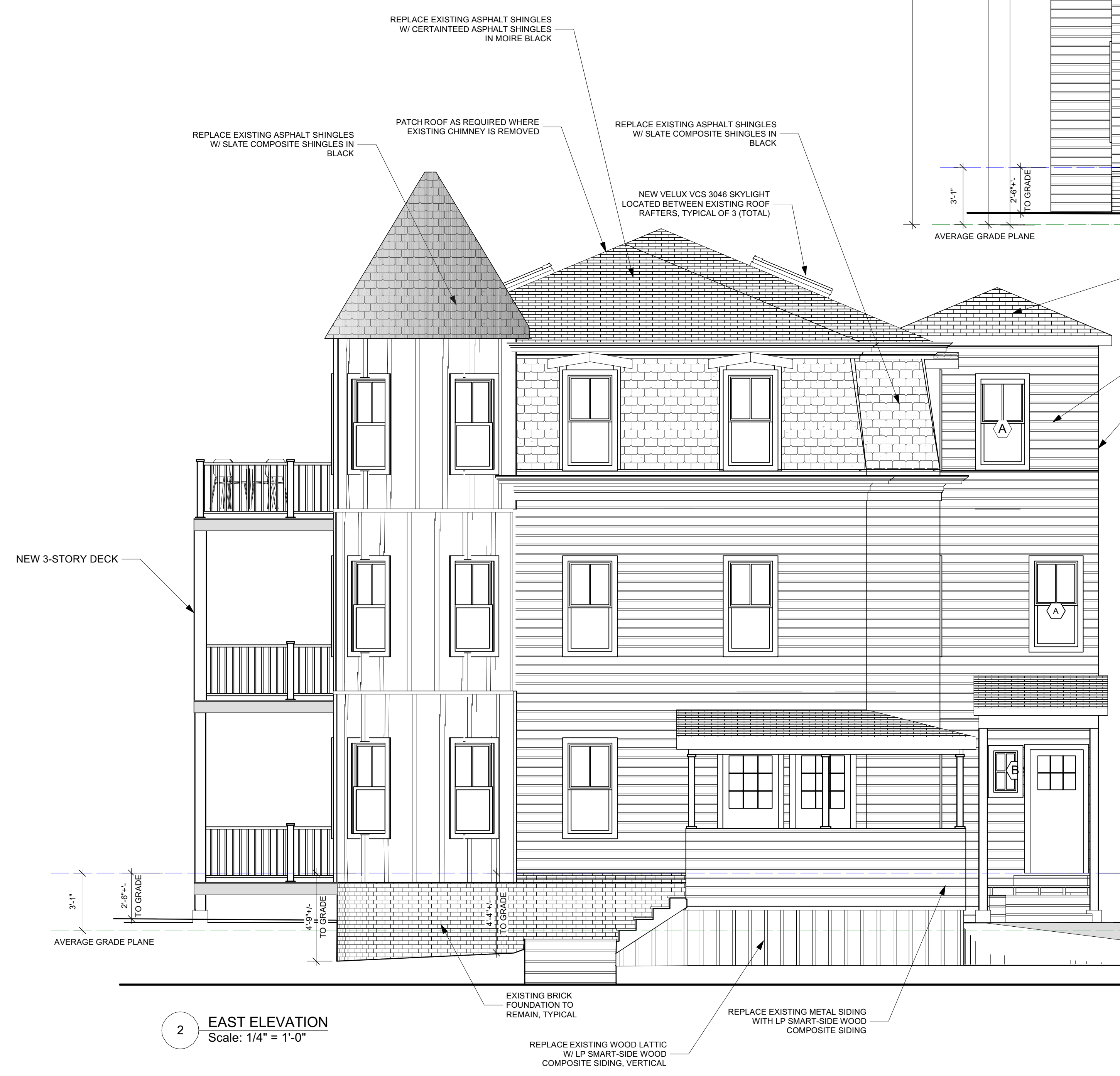
2 EAST ELEVATION Scale: 1/4" = 1'-0"