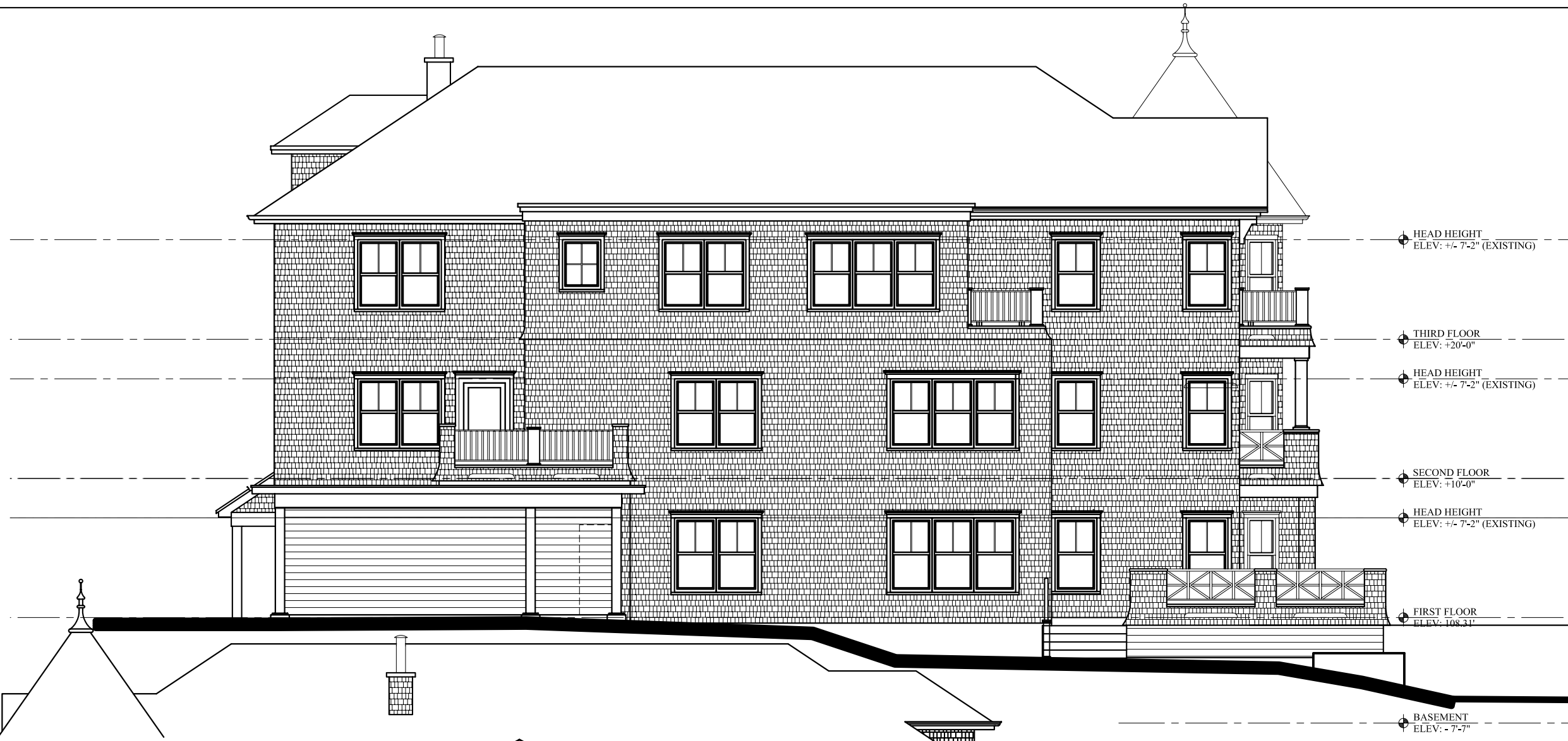
LEFT ELEVATION SCALE: 1/4" = 1'-0"

HEAD HEIGHT ELEV: +/- 7'-2" (EXISTING) THIRD FLOOR ELEV: +20'-0" HEAD HEIGHT ELEV: +/- 7'-2" (EXISTING) SECOND FLOOR ELEV: +10'-0" HEAD HEIGHT ELEV: +/- 7'-2" (EXISTING) FIRST FLOOR ELEV: 108.31' BASEMENT ELEV: - 7'-7"