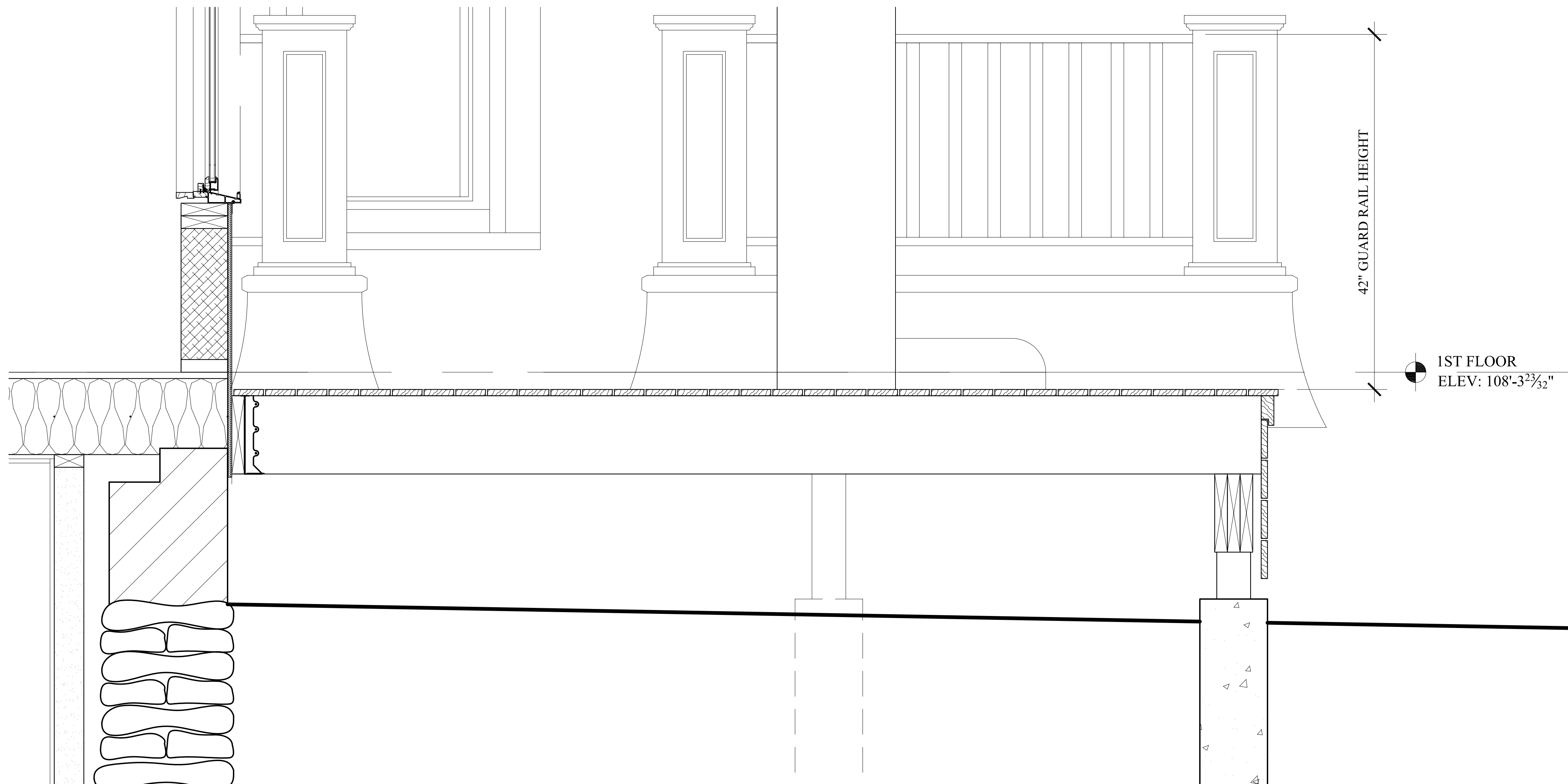
DD2 DECK DETAIL A-3.2 SCALE: 1 1/2" = 1'-0"