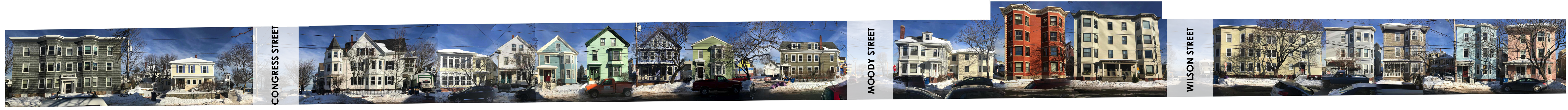
1 MORNING STREET NORTH