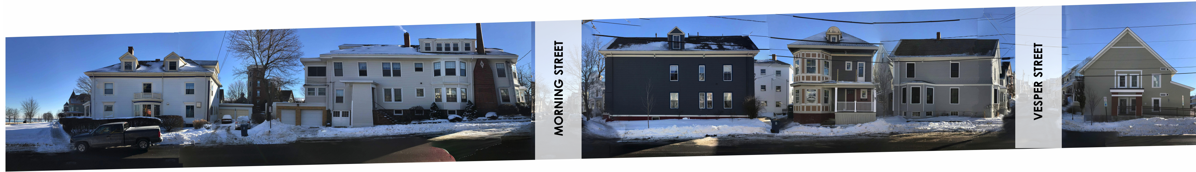
4 MOODY STREET EAST