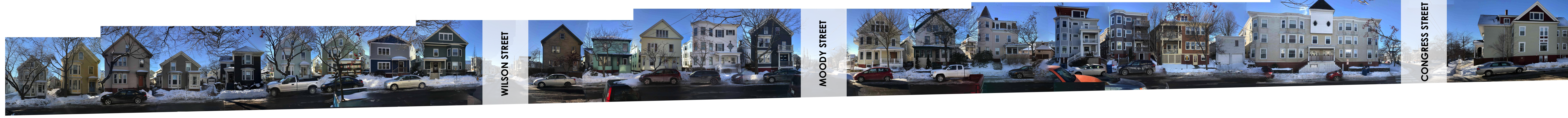
2 MORNING STREET SOUTH