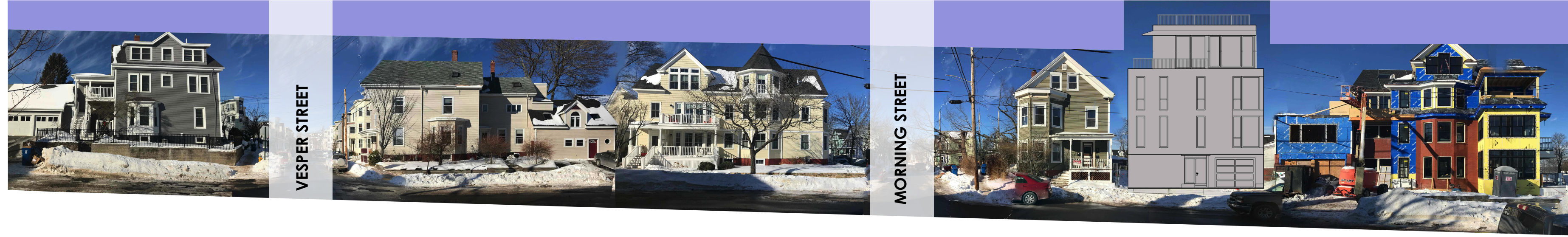
3 MOODY STREET WEST