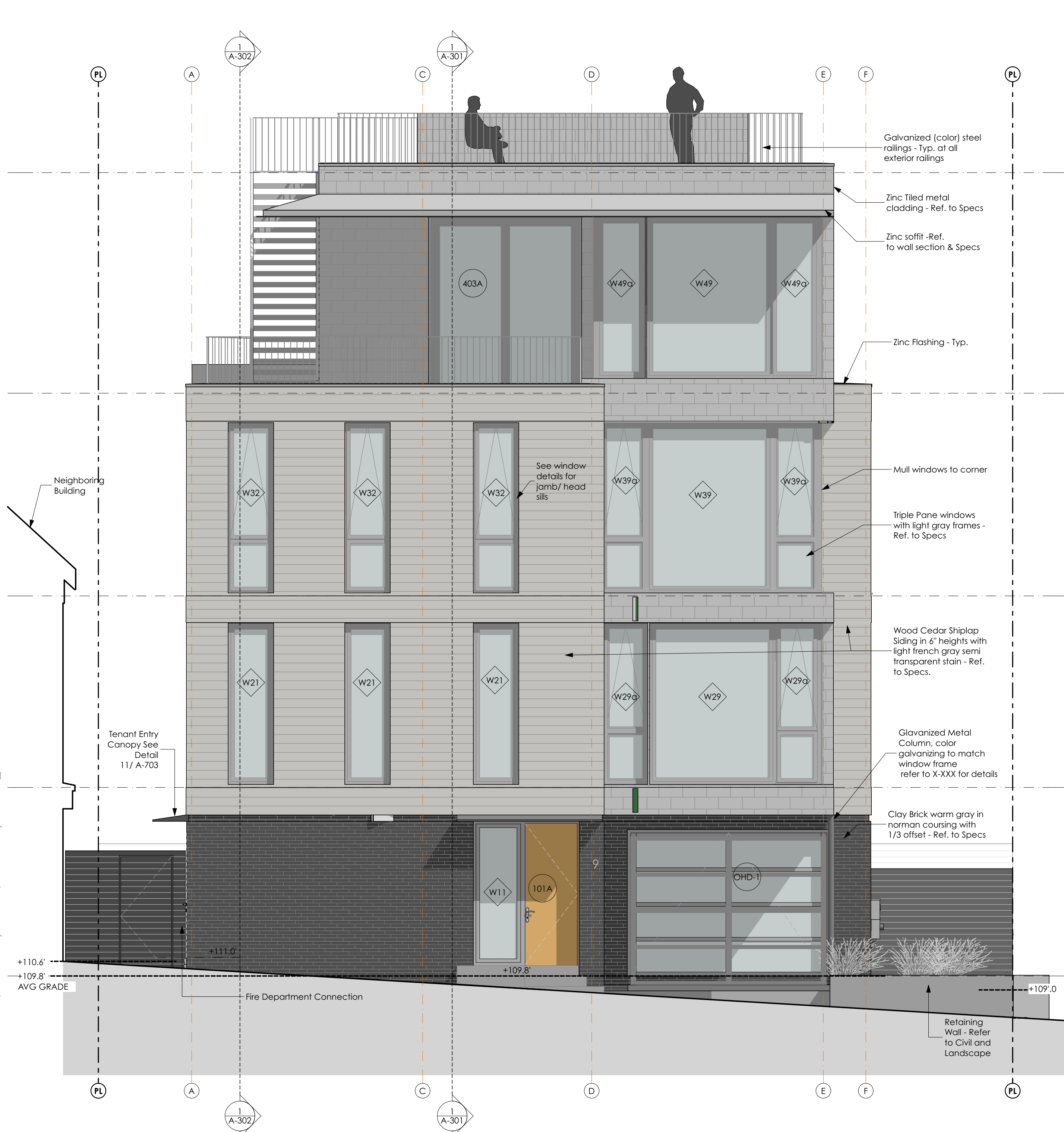
1 SOUTH ELEVATION (FRONT) SCALE: 1/4" = 1'-0"