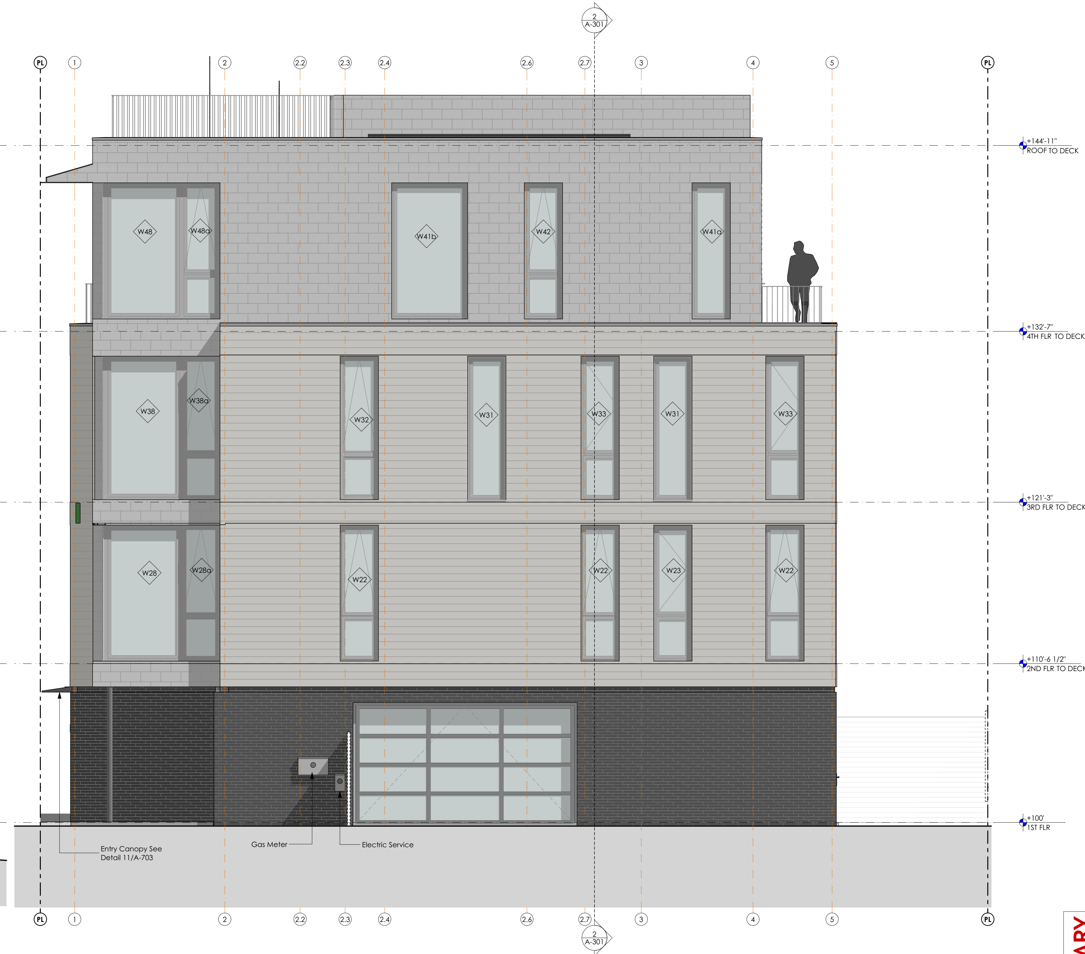
2 EAST ELEVATION (OCEAN) SCALE: 1/4" = 1'-0"