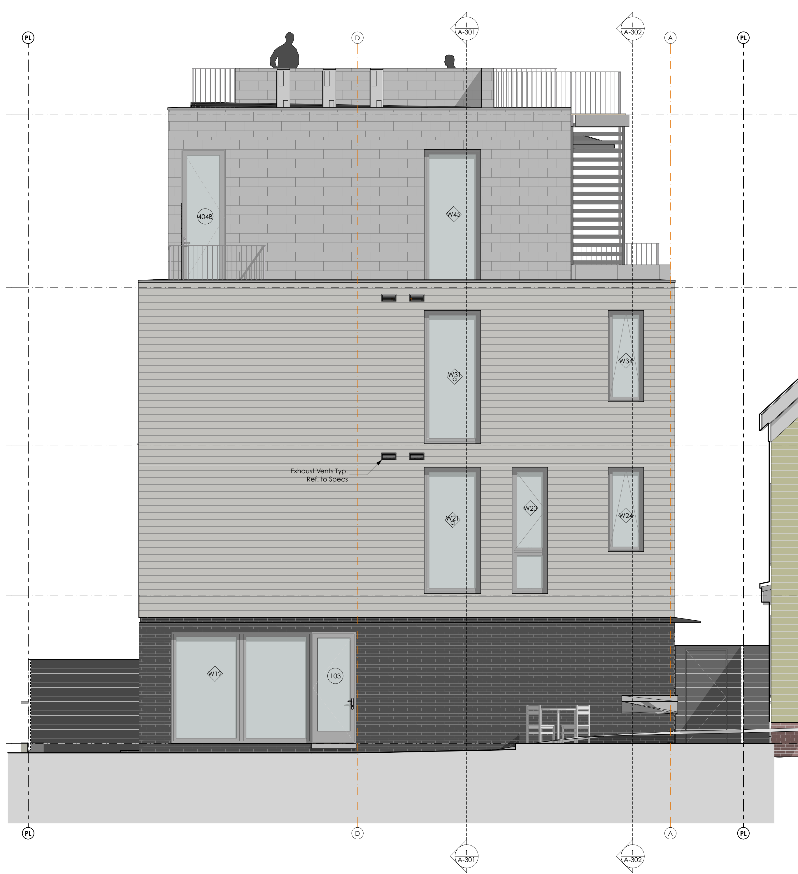
1 NORTH ELEVATION SCALE: 1/4" = 1'-0"