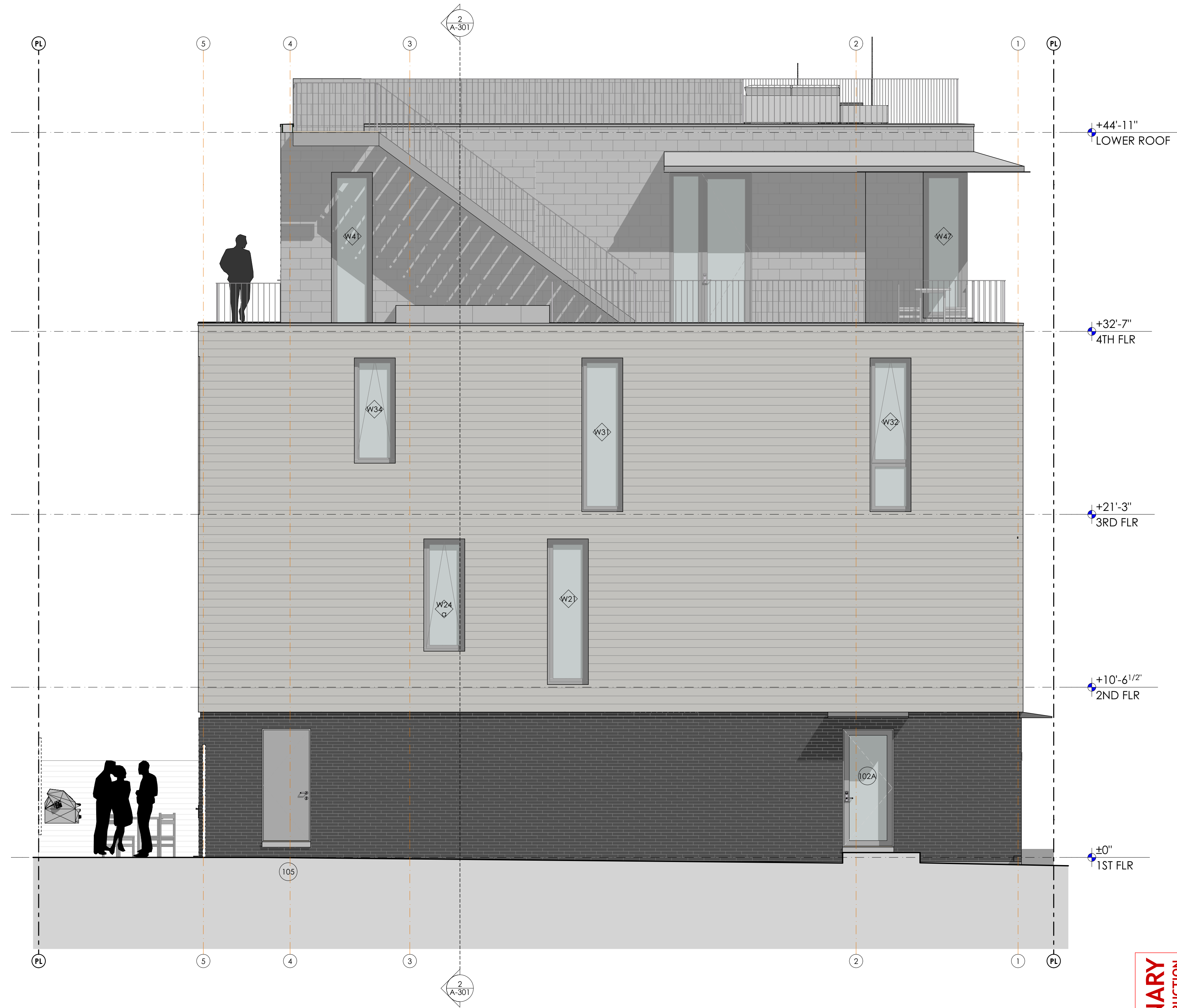
2 WEST ELEVATION SCALE: 1/4" = 1'-0"