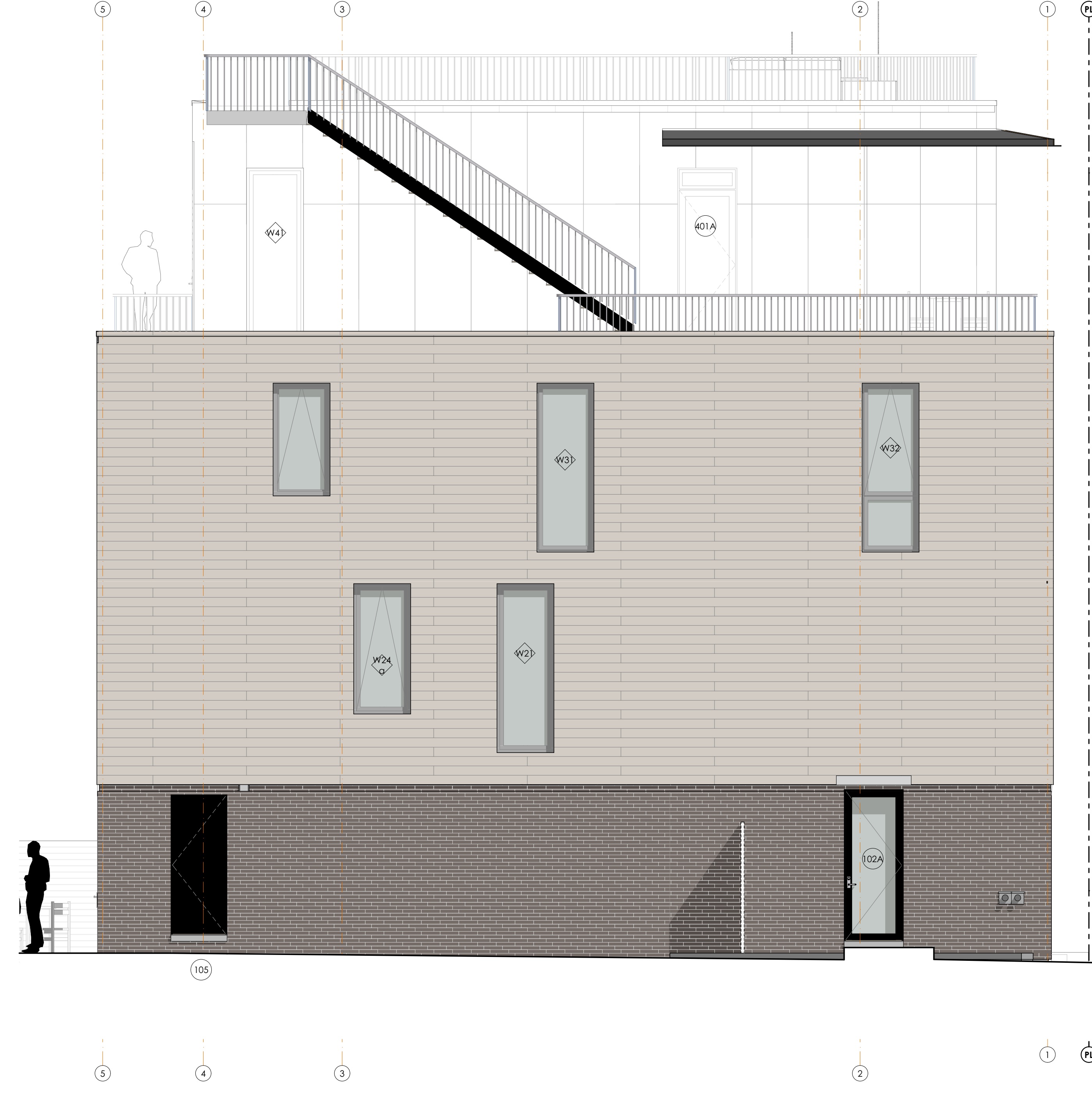
2 WEST ELEVATION SCALE: 1/4" = 1'-0"