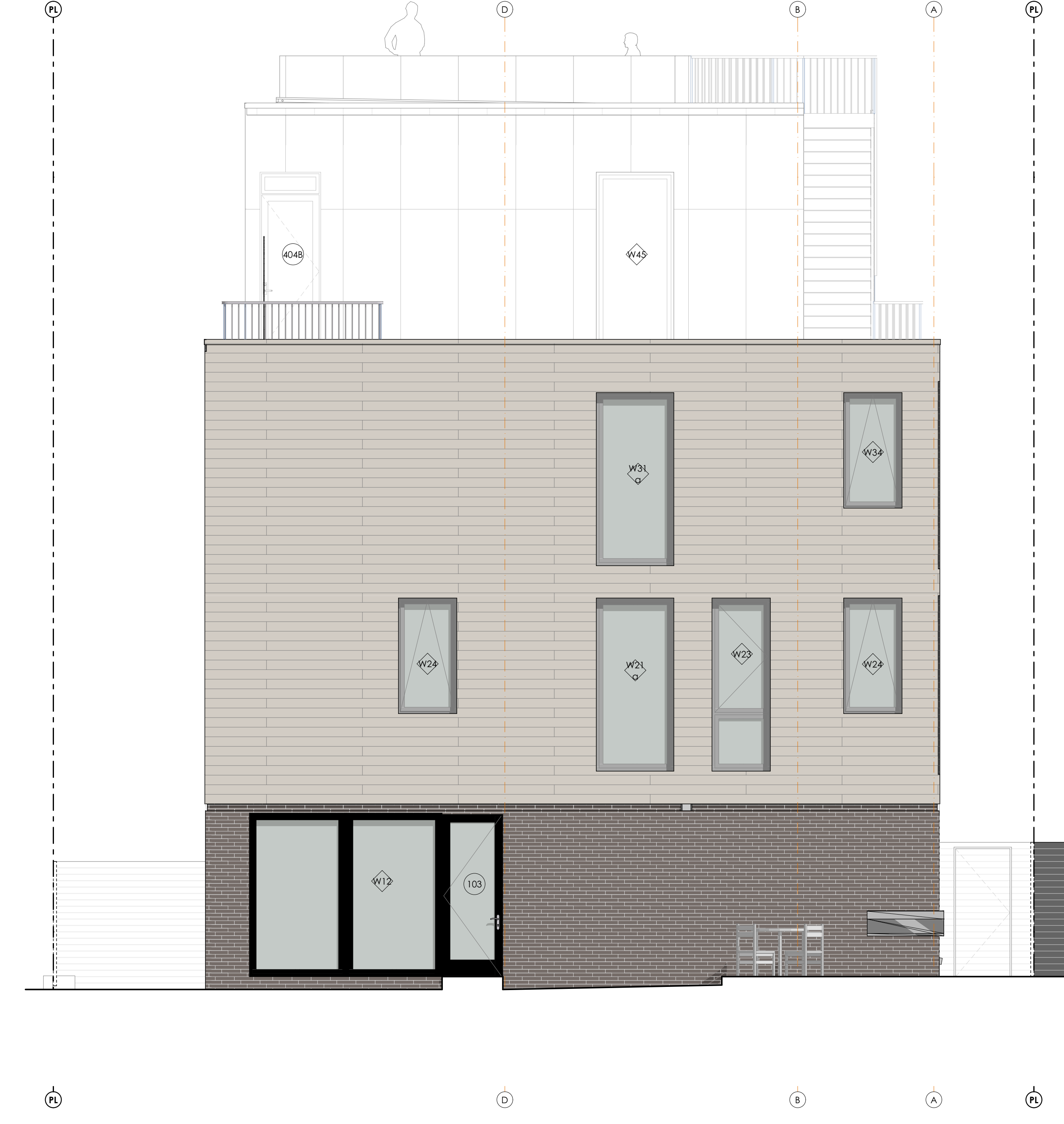
1 NORTH ELEVATION SCALE: 1/4" = 1'-0"