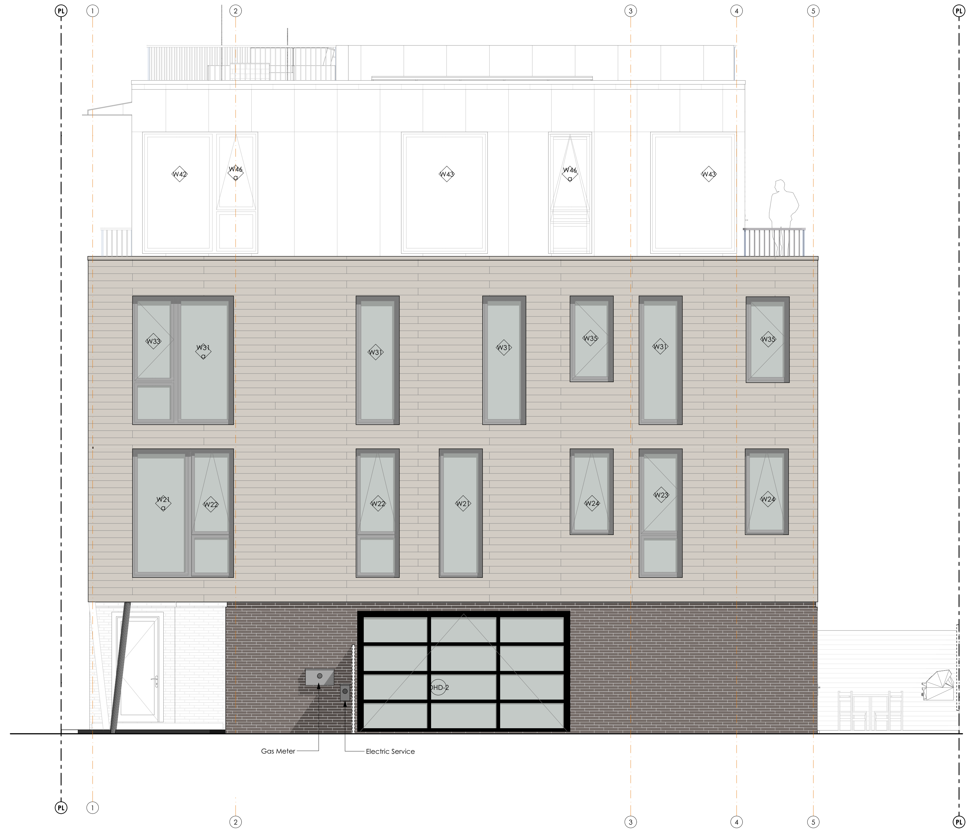
2 EAST ELEVATION (OCEAN) SCALE: 1/4" = 1'-0"