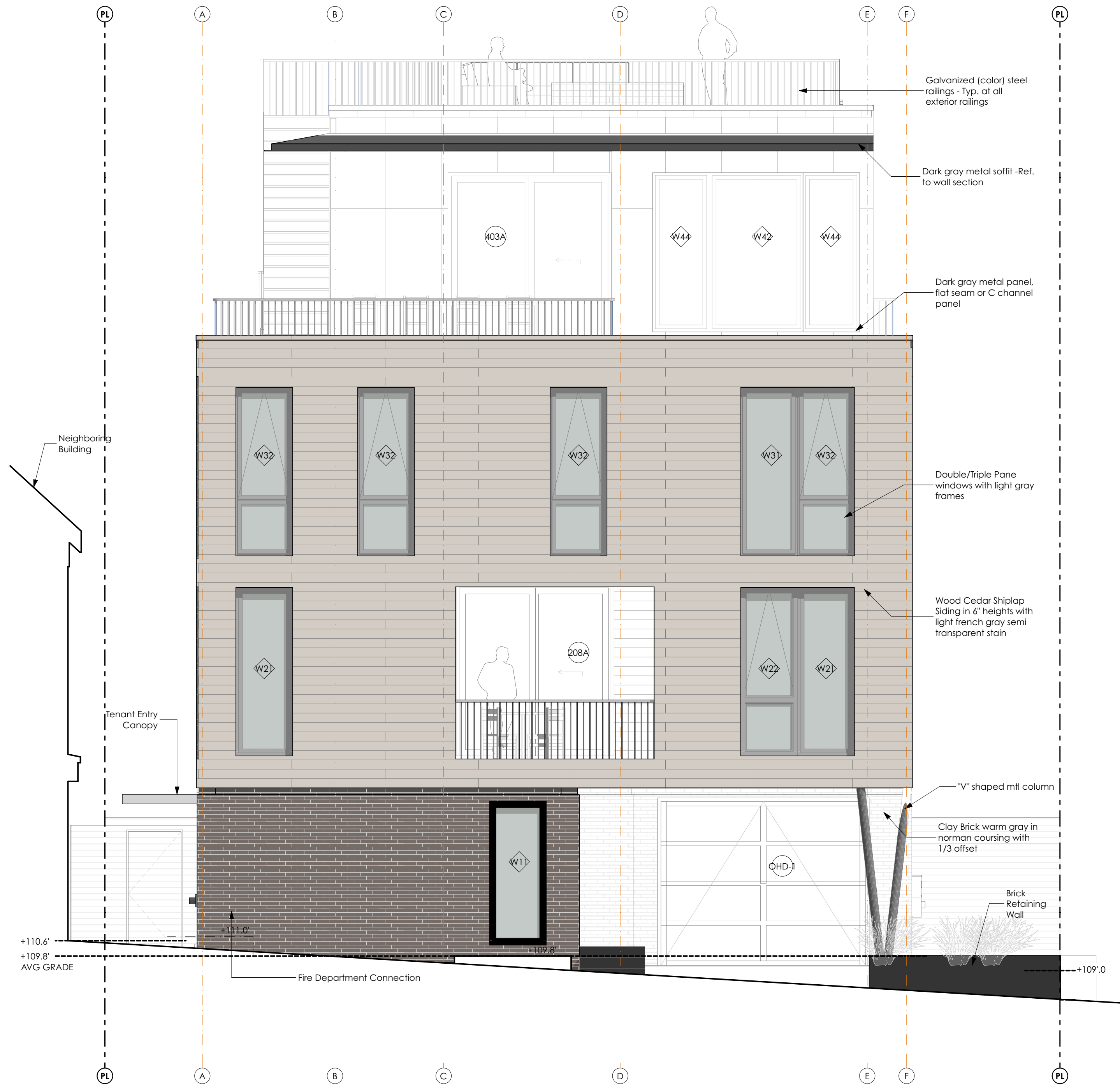
1 SOUTH ELEVATION (FRONT) SCALE: 1/4" = 1'-0"