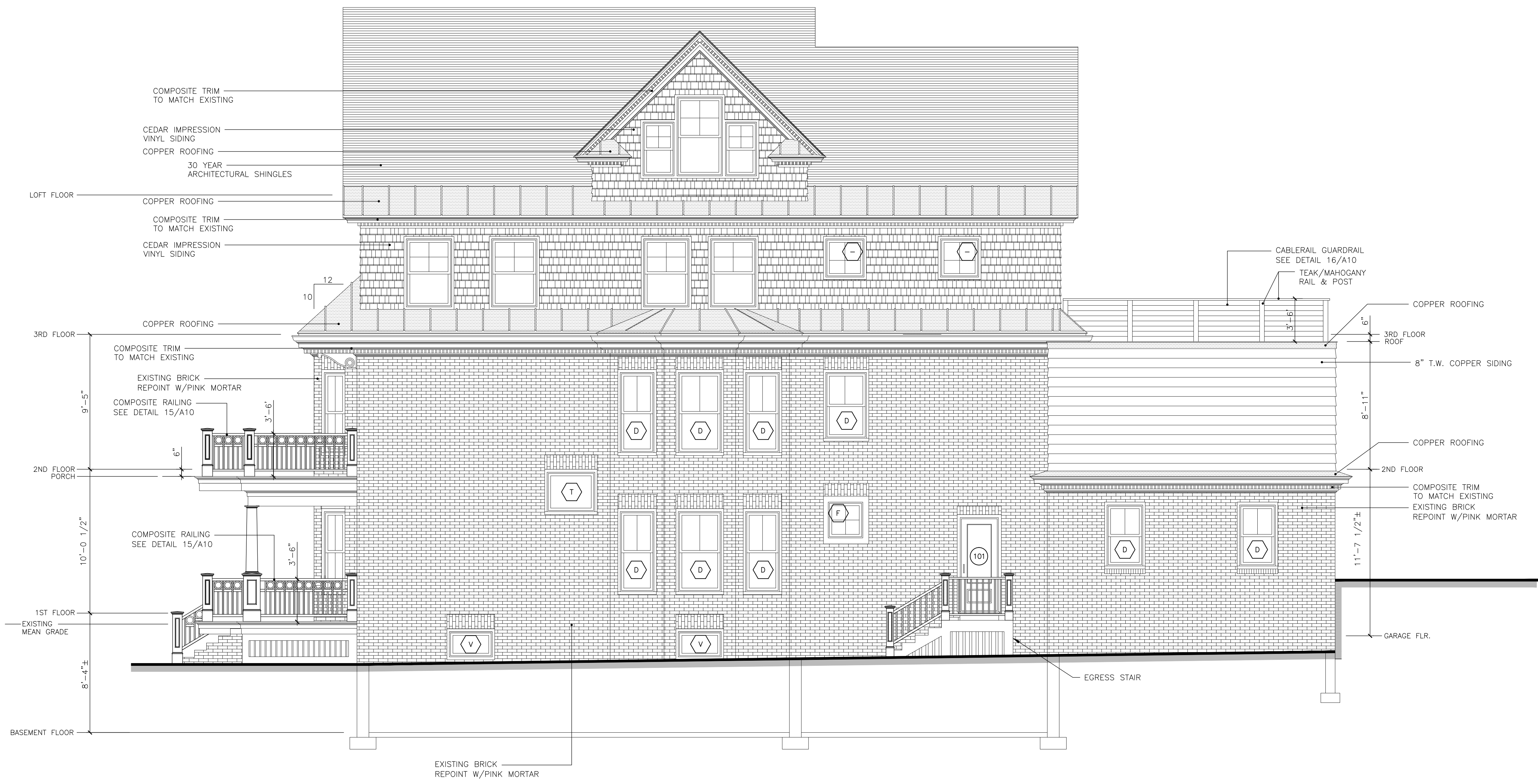
WEST SIDE ELEVATION

SHEET A2 COPYRIGHT REPRODUCTION OR REVISE OF THIS DOCUMENT WITHOUT WRITTEN PERMISSION FROM GRANT HAYS ASSOCIATES IS PROHIBITED.