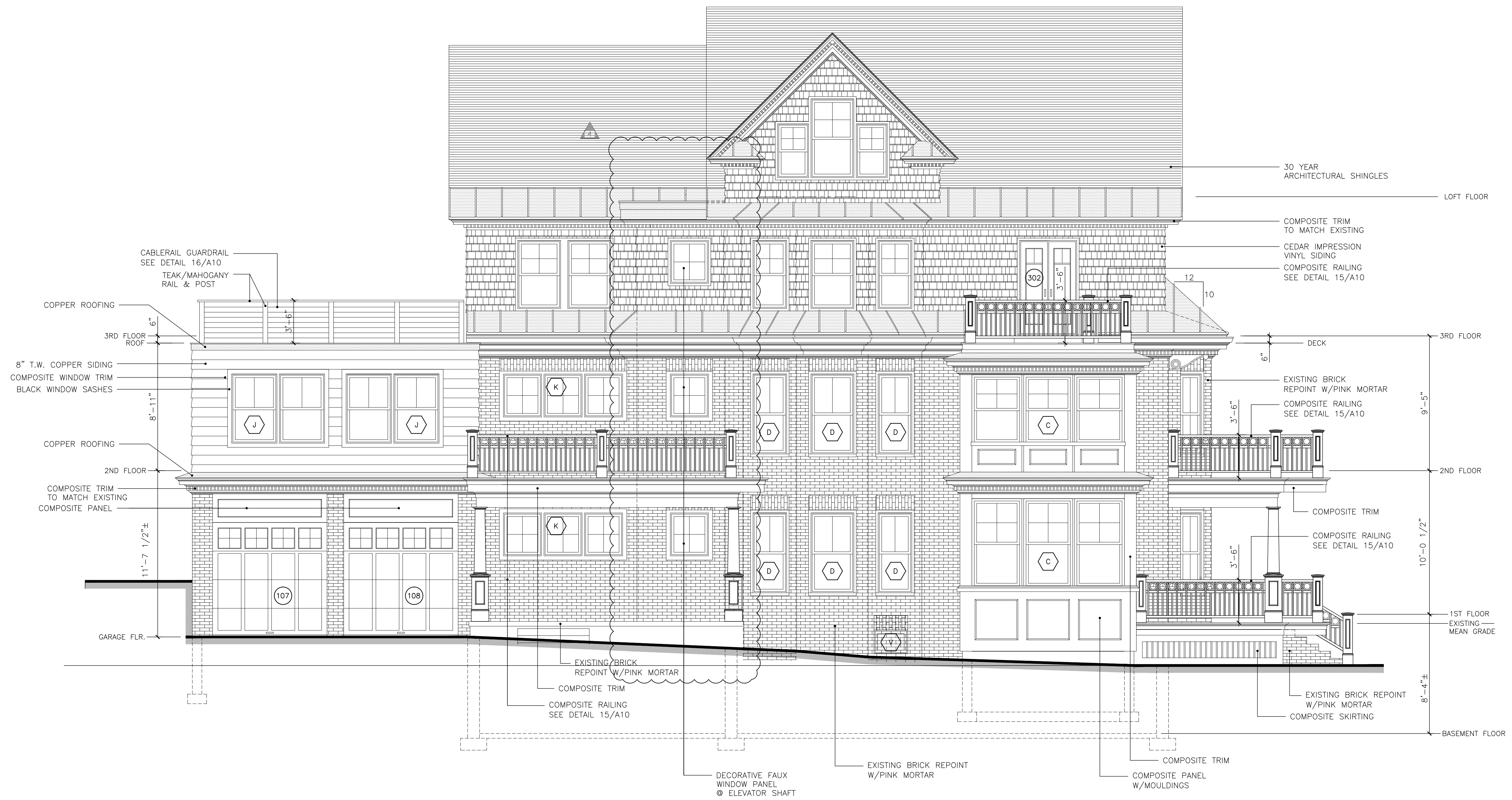
MOODY STREET ELEVATION

COPYRIGHT REPRODUCTION OR REV. OF THIS DOCUMENT WITHOUT WRITTEN PERMISSION FROM GRANT HAYS ASSOCIATES IS PROHIBITED.