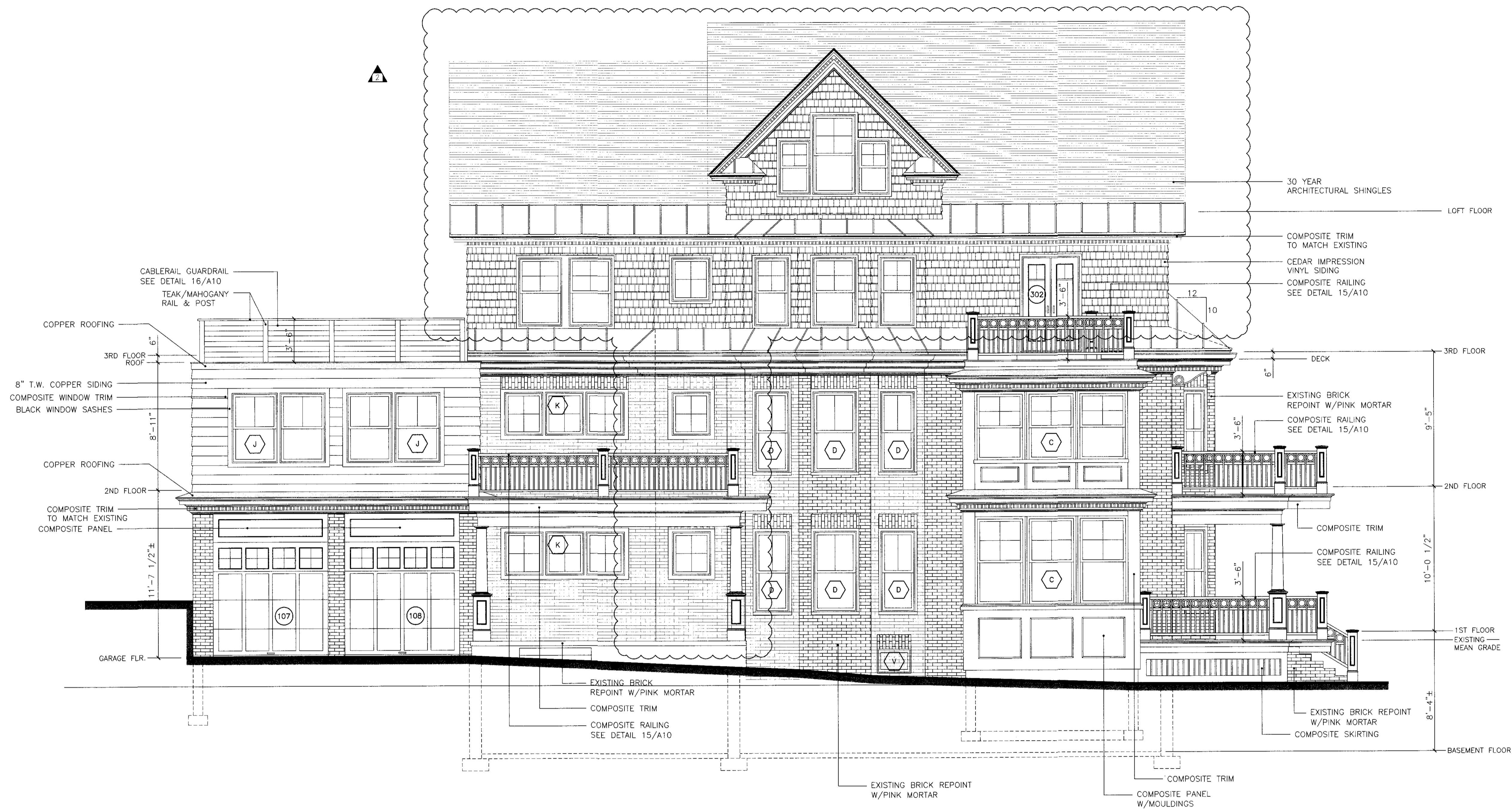
MOODY STREET ELEVATION

COPYRIGHT REPRODUCTION OR REVUE OF THIS DOCUMENT WITHOUT WRITTEN PERMISSION FROM GRANT HAYS/ ASSOCIATES IS PROHIBITED.