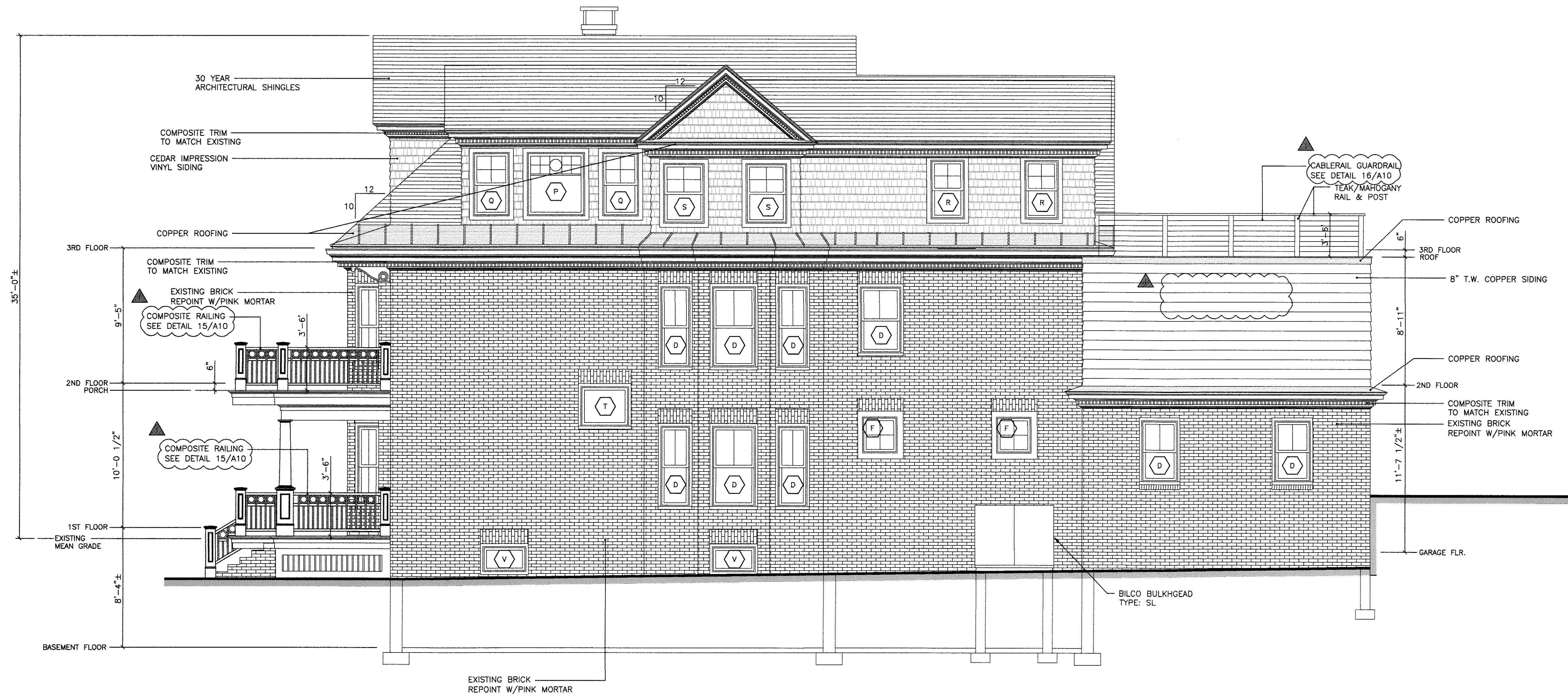
WEST SIDE ELEVATION

COPYRIGHT REPRODUCTION OR REVISE OF THIS DOCUMENT WITHOUT WRITTEN PERMISSION FROM GRANT HAYS ASSOCIATES IS PROHIBITED.